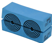
Moduly GM s technologií Multidiameter™