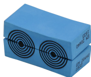
Moduly EM s technologií Multidiameter™